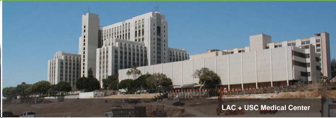
LAC + USC Medical Center