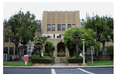
VA Medical Center Los Angeles