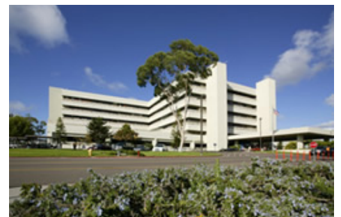
VA Medical Center San Diego