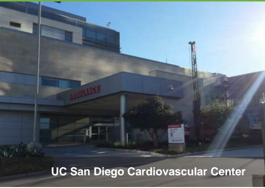
UC San Diego Cardiovascular Center