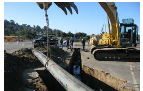
Del Mar Fairgrounds Force Main Sewer Relocation