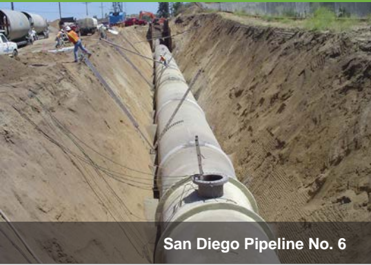
San Diego Pipeline No. 6